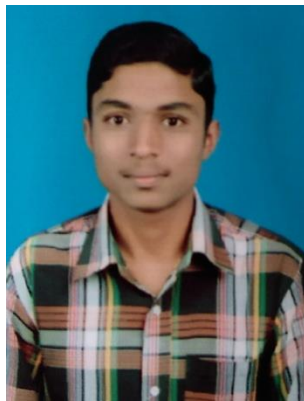
POWAR SANDESH Bharat Forge